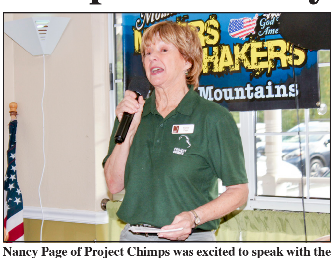
Mountain Movers & Shakers civic group last Friday.

Due to the fact that they share more than 95% of their DNA with humans,