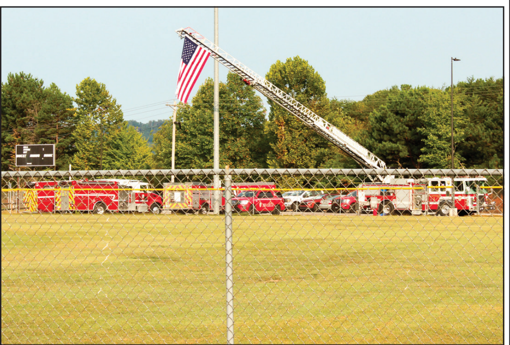
Union County Fire lifted Old Glory high with Ladder 1 at the 9/11 remembrance in Meeks Park last Wednesday.